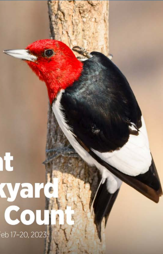
Red-headed Woodpecker.